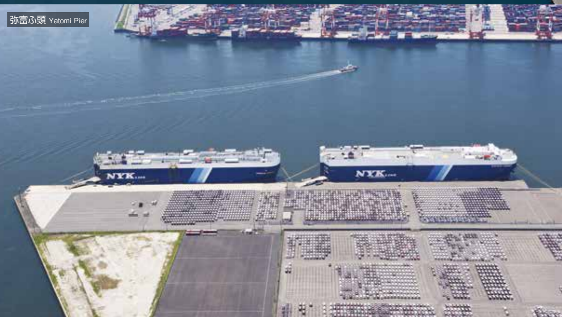
弥富ふ頭 Yatomi Pier

In addition to their function as a base for importing and exporting completed automobiles, these piers also comprise a hub at the Port of Nagoya where completed automobiles produced overseas are brought together and re-exported around the world.