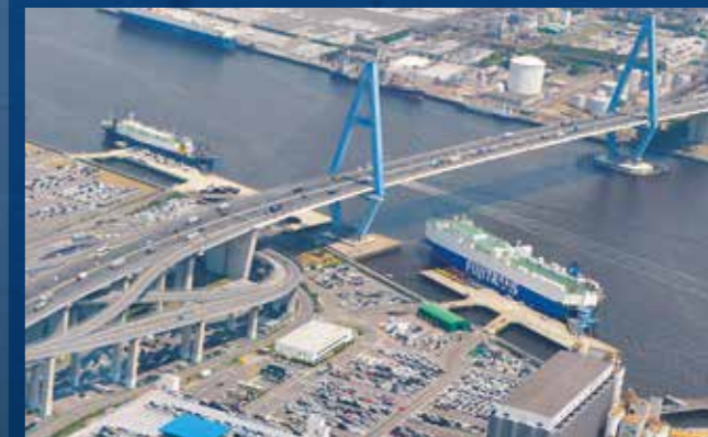
完成自動車ふ頭別取扱比率 Automobile Shipments by Pier

This is a vehicle loading base for domestic destinations. It was originally developed as a base for petroleum products. However, it has recently been given another role as an automobile shipping base for areas inside Japan. The number of automobiles handled here matches that of Shimpo Pier on the opposite shore.