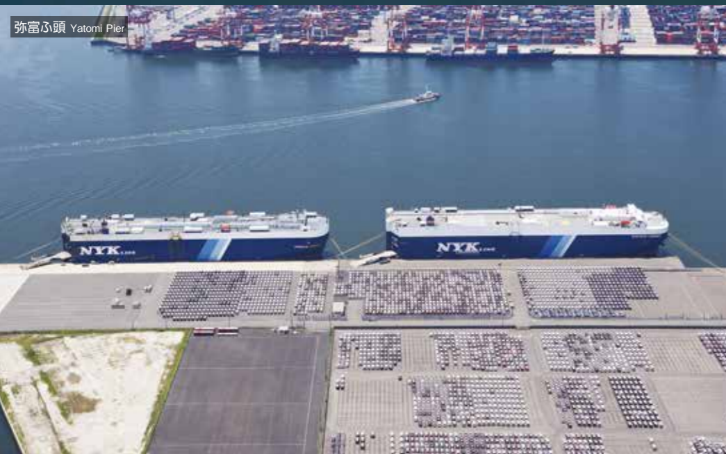
弥富ふ頭 Yatomi Pier

The Port of Nagoya is developing a new berth and storage yard for automobiles at Kinjo Pier. This will integrate its function as a base for automobiles in the Port and promote the Port as automotive hub.